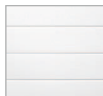
3717 Light Ribbed Panel