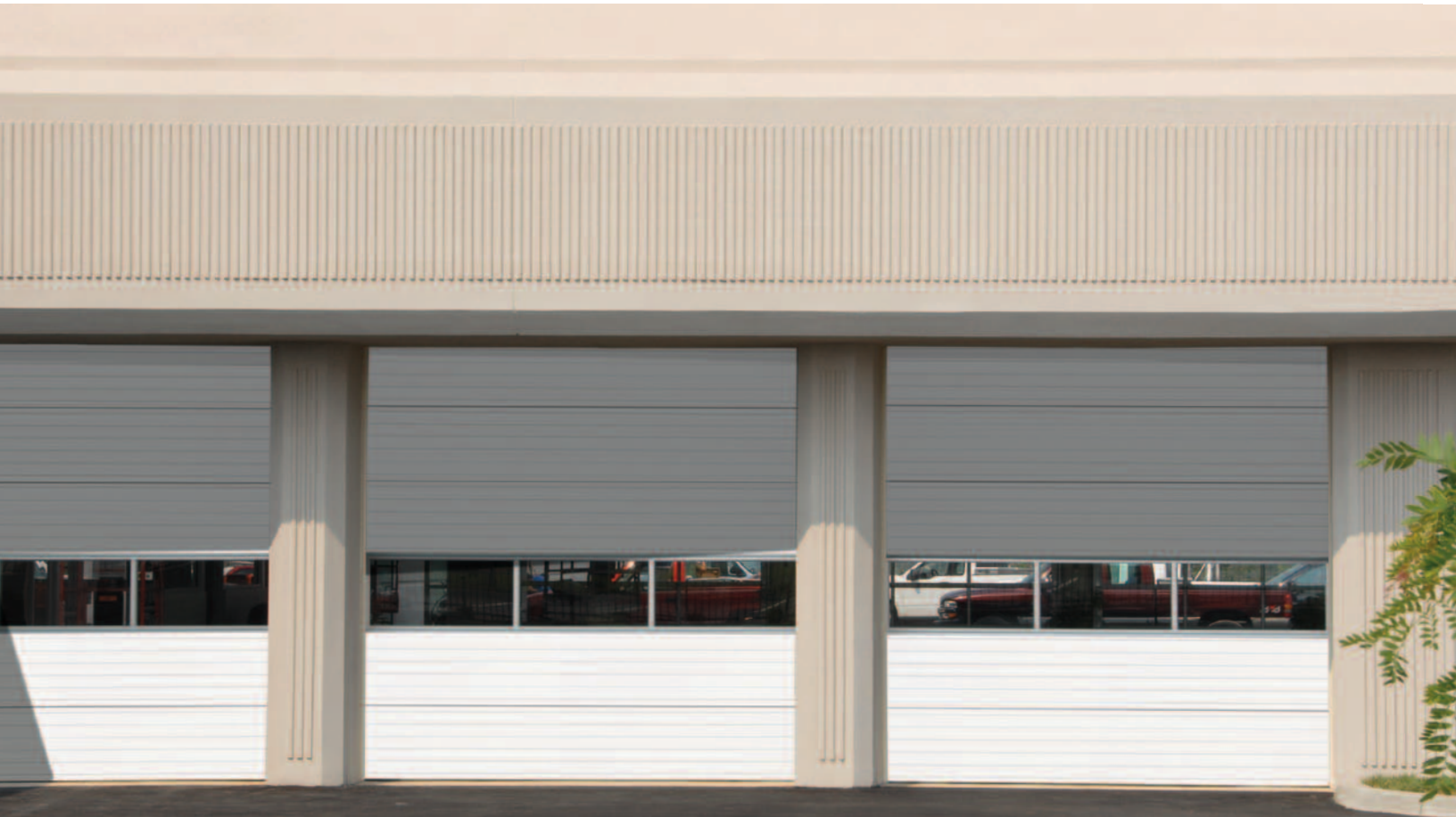
Model 3720 with Full Vision Section